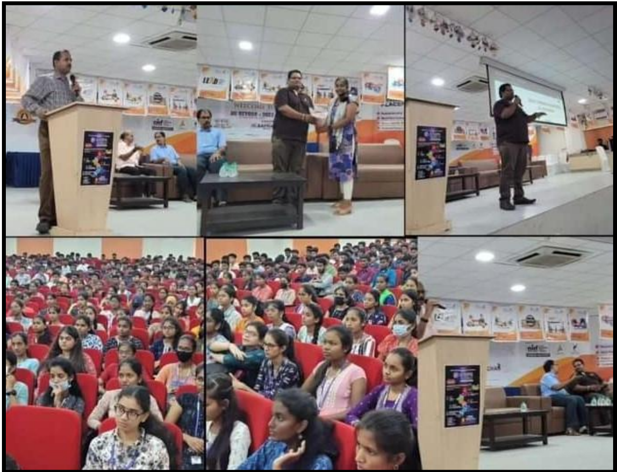
A glimpse of the Codetantra programme

An interesting session was conducted by the Codetantra team on the 10 th of November,2023 at the MRCET auditorium. Codetantra is an educational coding platform that provides online tools specially designed to teach programming and coding skills to learners of various levels, from beginners to advanced users. This platform often provide interactive learning experiences, tutorials, and coding challenges to help users build practical coding skills. The team urged the students to seriously work on this tool for four years, and become a pro at it as all the programming subjects of B.Tech courses are specially designed on this platform.